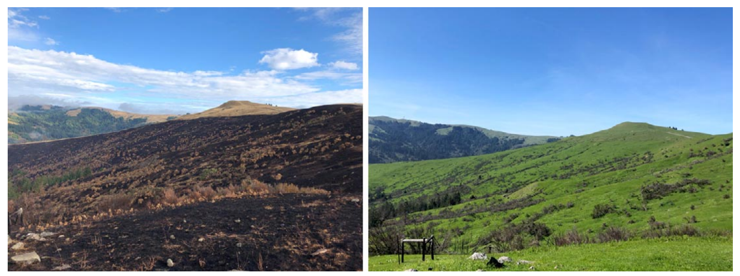
Prescribed fire can be used to halt woody encroachment and maintain grasslands. Humboldt County, CA, just after a Fall 2018 burn (left), and seven months later in Spring 2019 (right).