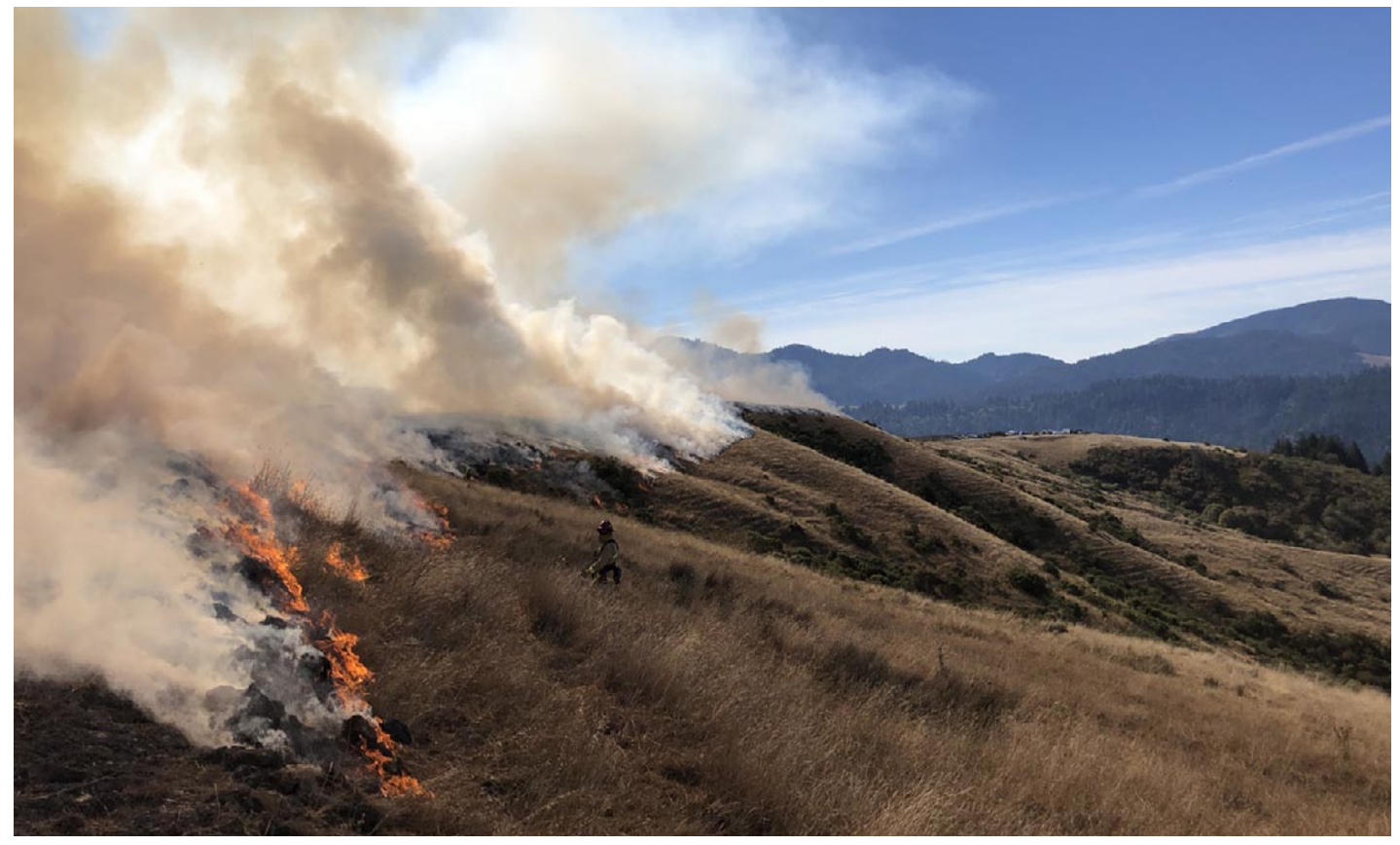
With two units totaling 345 acres, this burn in Humboldt County was the largest NRCS-funded burn in California history. Humboldt County Prescribed Burn Association, Fall 2018.